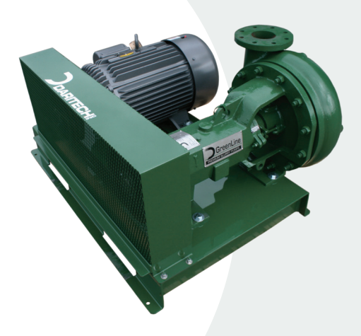
GreenLine 250 Electric Pump Skids

From impellers designed for low turbulence and wear, to heavy duty shaft bearing assemblies, GreenLine pumps are built to last. With experience in numerous applications of GreenLine pumps, going back to 1995, we continue to bring innovative solutions and continued improvement to dairy operations. You can be sure we will always be looking to the future, keeping up with the growing demands of dairying worldwide.