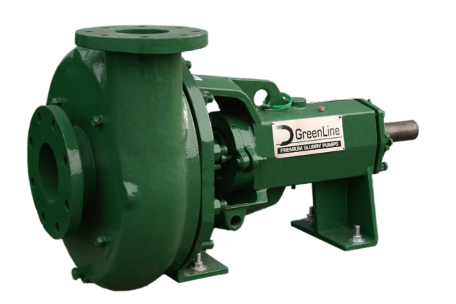
GreenLine 250 Series Pump

The GreenLine Pump line offers a full range of pump sizes and horsepower to meet your requirements. We can accommodate your pump needs with anything from a half horsepower pump to move fifty gallons per minute in our 118 series, to two hundred horsepower to move five thousand gallons per minute in our 250 series. With GreenLine's robust casting and exacting tolerance specifications, we can ensure proper performance and reliability for years to come.