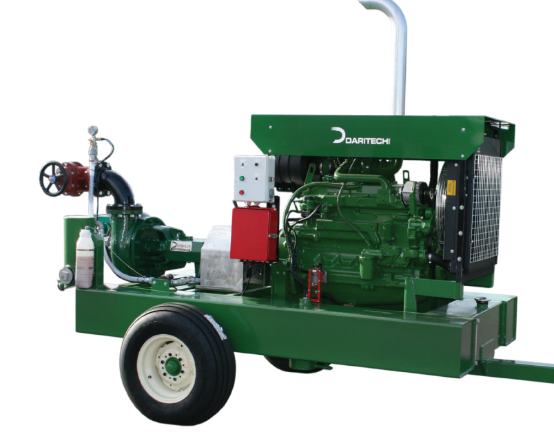
Run dry seal systems available for non-flooded suction system.

High pressure, high RPM floater pump used for direct feed to field application equipment such as big guns or pivots. This pump delivers the same curves as 250 ST. 75 hp maximum.