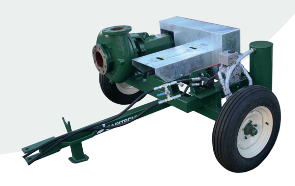
GreenLine 250 PTO Pump Drives