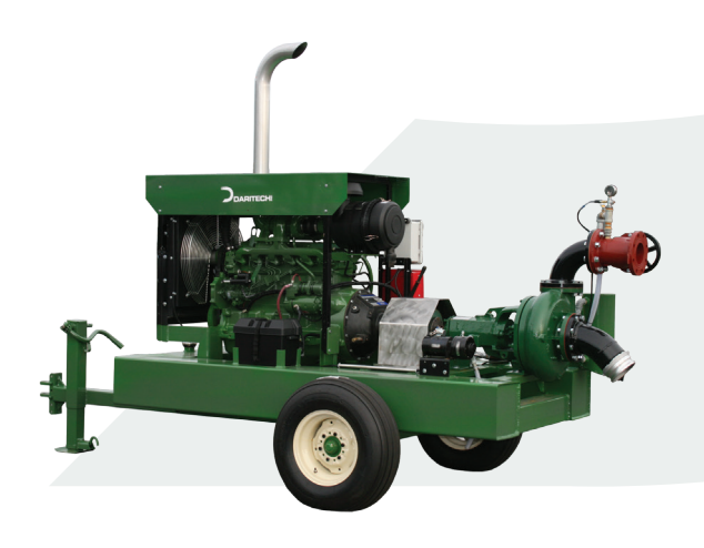
GreenLine 250 Diesel Pump Drives